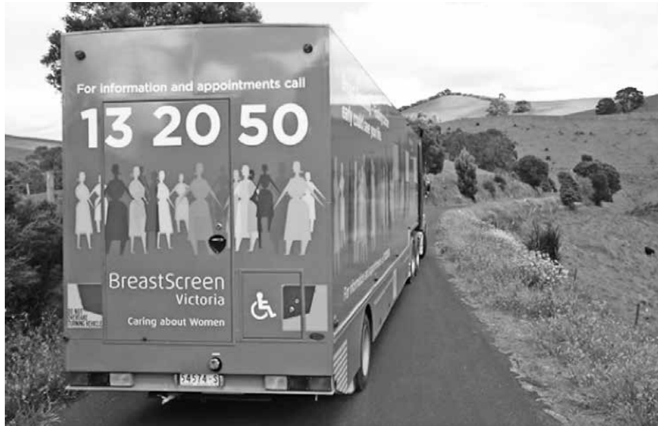
The Breast Screen van is coming to Nhill between 2nd and 15th June. Book your appointment NOW.