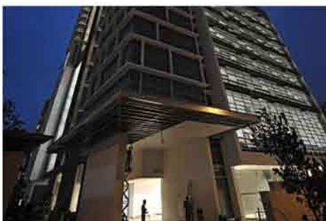
There is scope for Singapore to develop a new university model - one that is teaching-focused and practice-oriented with close industry ties, said Minister of State for Education Lawrence Wong in Parliament on Thursday. Mr Wong said the committee will study how best to implement such a model. One possibility is to leverage on the Singapore Institute of Technology (SIT), which is already pioneering some elements of this model.

Together with overseas partners, SIT offers a number of applied degrees in disciplines which need hands-on practice, such as occupational therapy and digital animation. It has also built close links with industry, receiving strong endorsement from industry partners, he said.