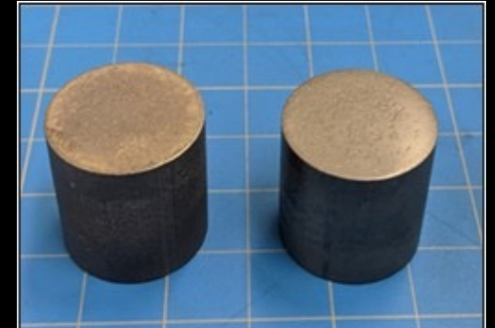
High density fuel samples for high temperature testing