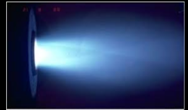
High power electric thruster