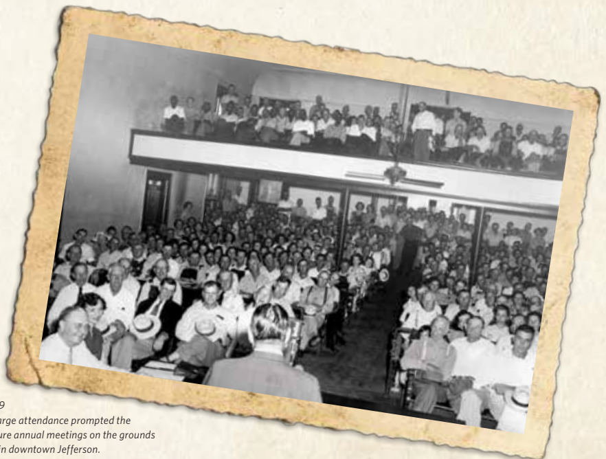
Members packed the Jackson County Courthouse for the 1949 Annual Meeting. The large attendance prompted the cooperative to hold future annual meetings on the grounds of co-op headquarters in downtown Jefferson.