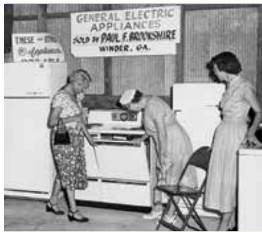
The 1956 Power Use Promotion partnered appliance dealers with EMCs to advertise electric appliances. Jackson EMC took part in the promotion by helping members pay for wiring when installing new appliances. Here, members inspect new General Electric appliances at the 1956 Annual Meeting.