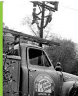
Jackson EMC linemen worked long hours to build the rural electric system. When this 1958 photograph was taken, the co-op maintained 2,659 miles of line serving almost 14,000 members.

1938 . . . . . 1950 . . . . . 1960 . . . . . 1970 . . . . .