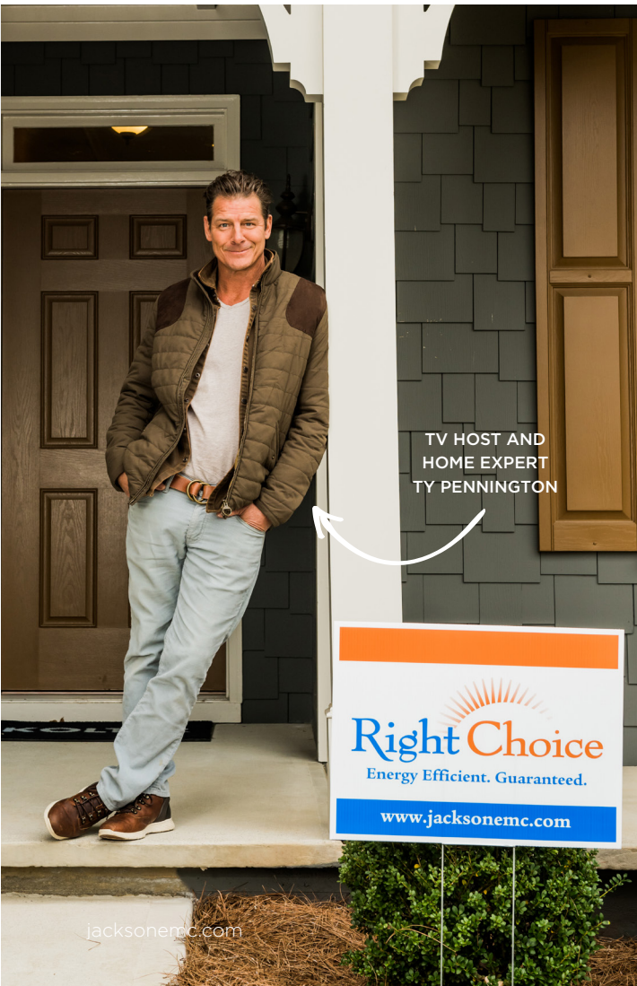
TV HOST AND HOME EXPERT TY PENNINGTON

SEND US YOUR BEST RECIPES: RECIPES@JACKSONEMC.COM OR MAIL TO: COOPERATIVE COOKING | JACKSON EMC | PO BOX 38 | JEFFERSON, GA 30549 FIND MORE RECIPES AT WWW.JACKSONEMC.COM/RECIPES .