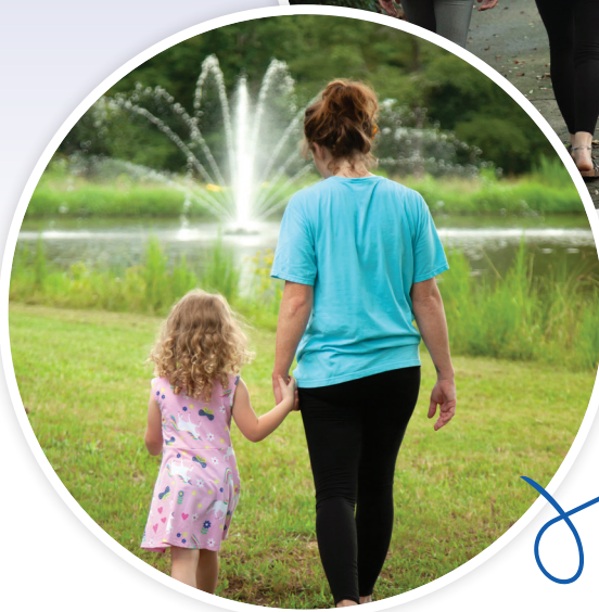
Sacred Roots Farm residents are secure and safe in their new life with new friends at the farm.