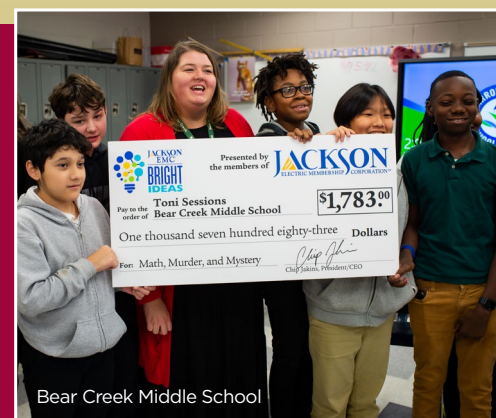
Bear Creek Middle School