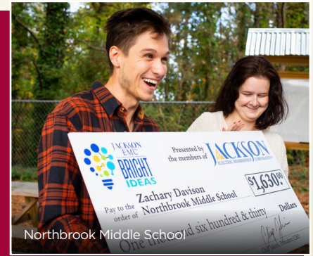
Northbrook Middle School