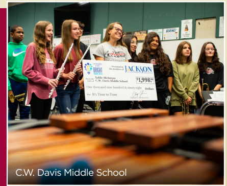
C.W. Davis Middle School