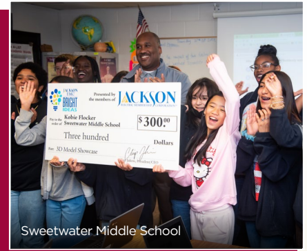
Sweetwater Middle School

AWARDED THROUGH THE BRIGHT IDEAS GRANT PROGRAM