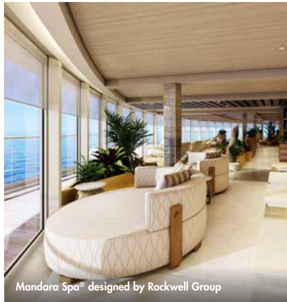
Mandara Spa® designed by Rockwell Group

Investment of more than $6 million on art.