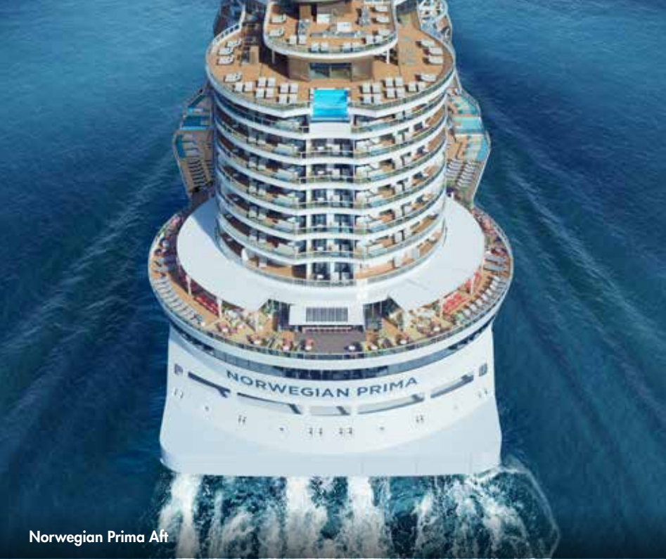
Norwegian Prima Aft