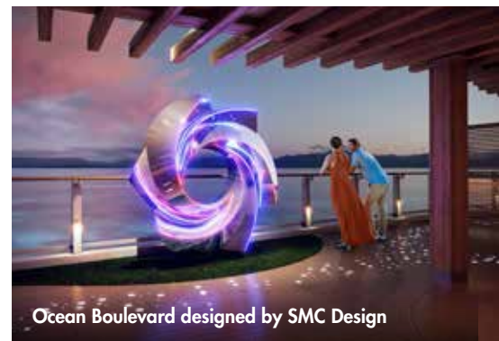
Ocean Boulevard designed by SMC Design