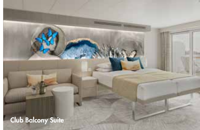
Club Balcony Suite

Most spacious accommodations for a new cruise ship.