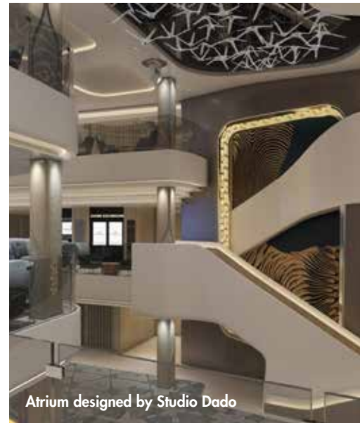
Atrium designed by Studio Dado