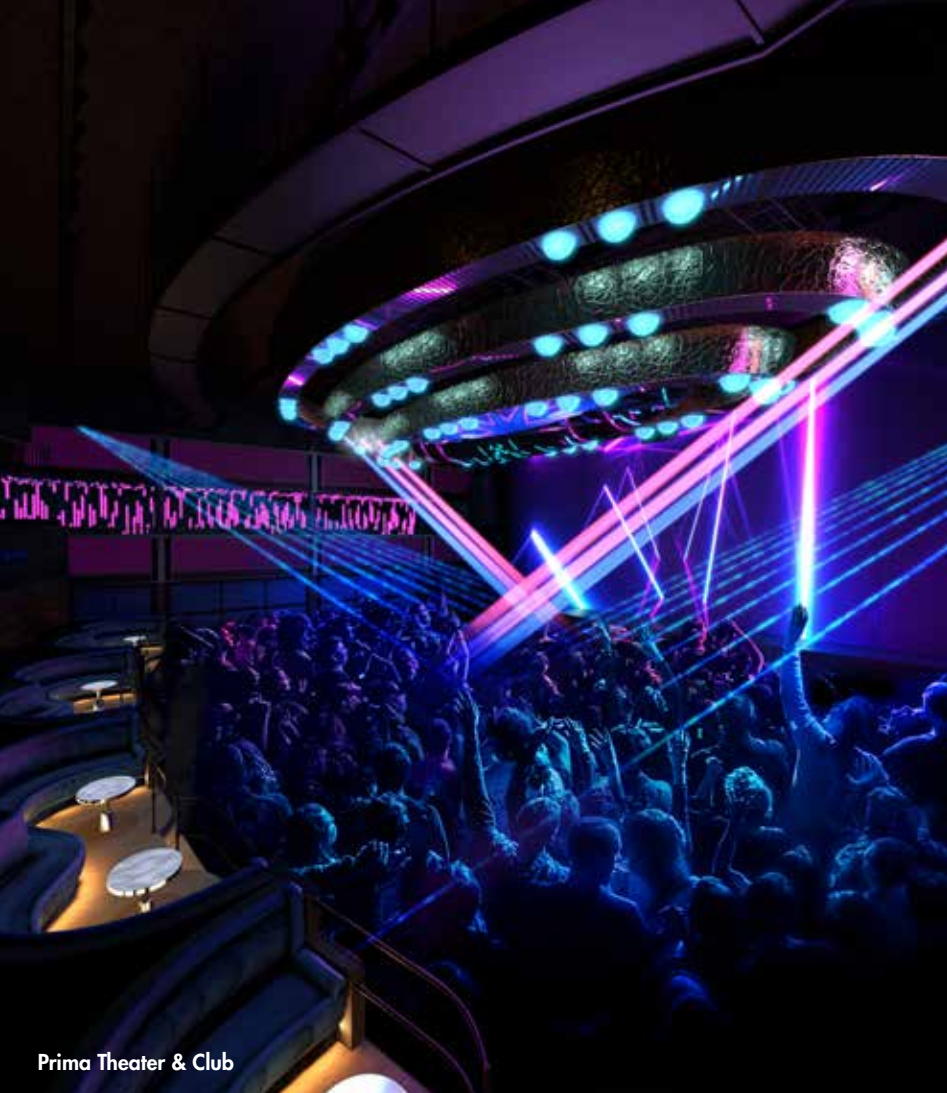
Prima Theater & Club