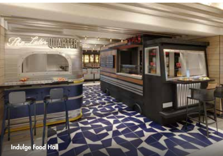
Indulge Food Hall