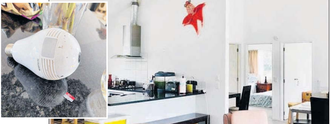
SOMEBODY'S WATCHING ME: People preparing for a wedding say they discovered a spy camera in a lightbulb at an Auckland Airbnb was recording them. A buzzing sound from the lightbulb alerted them. Pictures supplied